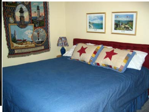
1 of the Bed Rooms (3 kings)